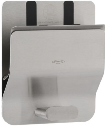
Patented, Patent Pending