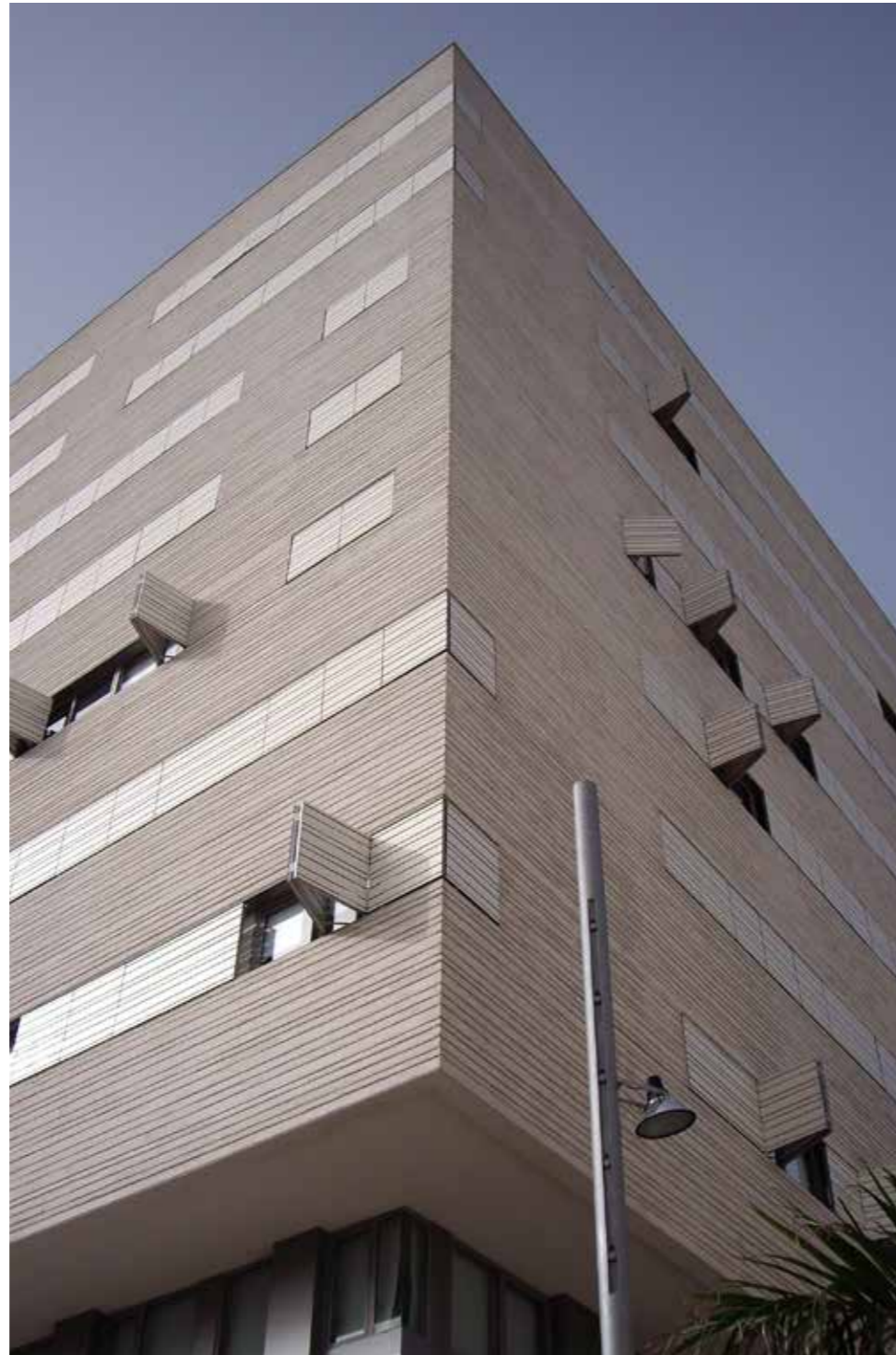
Los Molinos Building | Tenerife | Spain

There are many different positions and types of systems. Trespas® Meteon® is a perfect solution, since this material has the following principal characteristics: