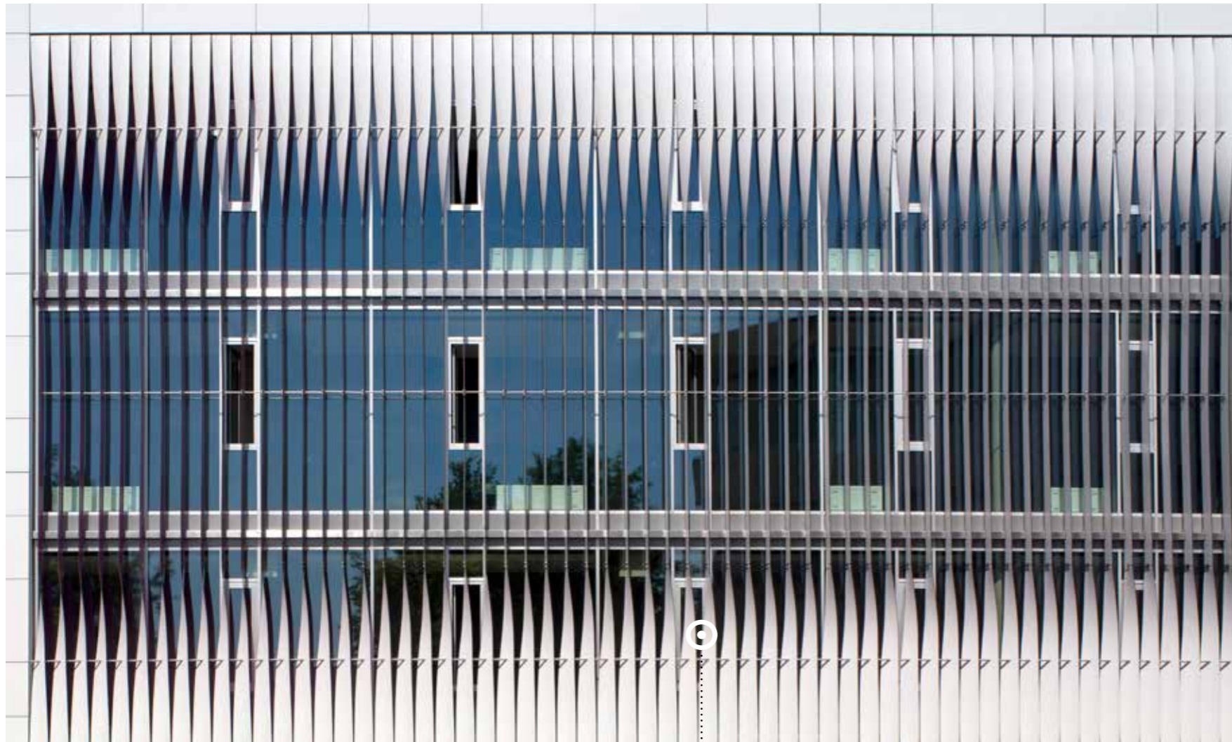
Education Centre | Haßfurt | Germany