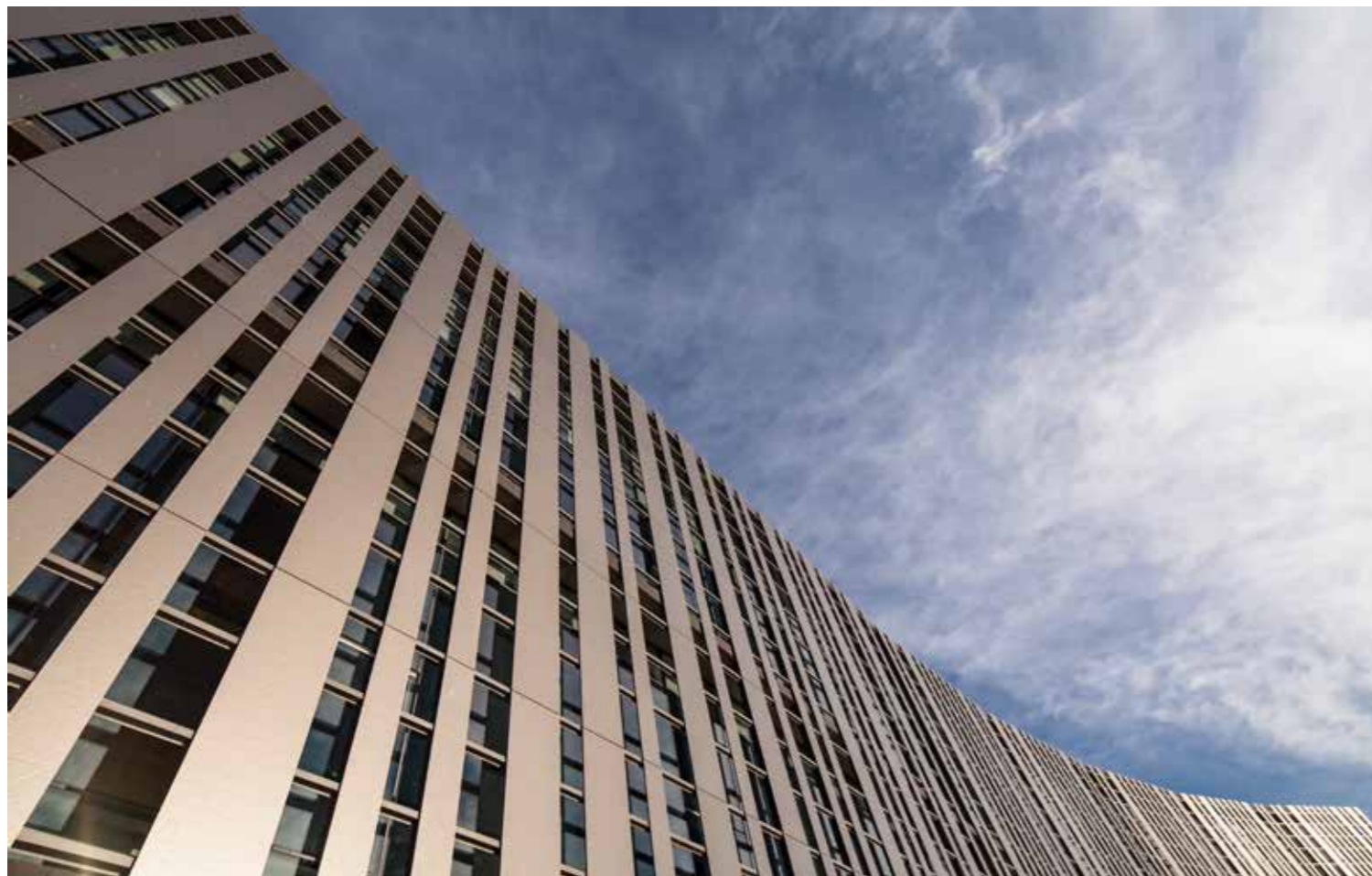
Duoc San Andres II building | Concepcion | Chile

The closed surface of Trespas® Meteon® practically withstands dirt accumulation, keeping the product smooth and easy to clean.