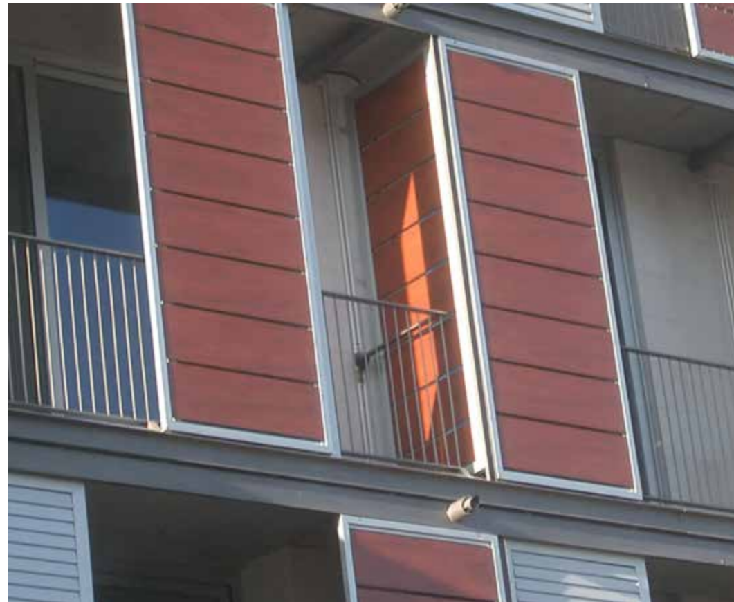
Apartments | Zaragoza | Spain

The entire Trespas® Meteon® range has been subjected to durability testing. This enables us to offer a 10-year worldwide limited warranty; for details about warranty see www.trespa.info .