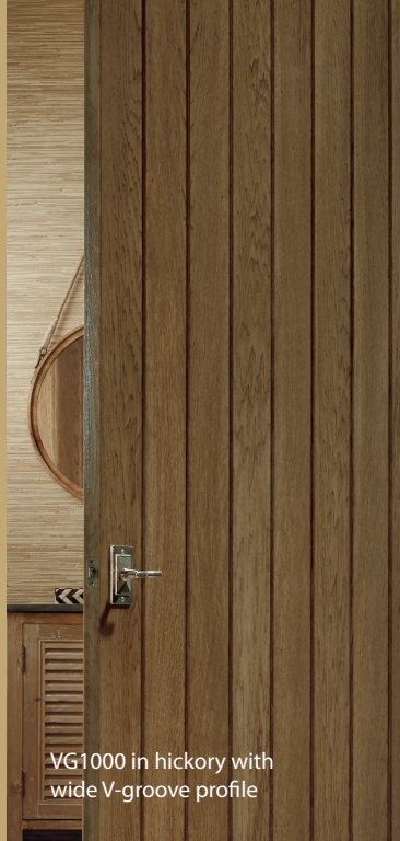
VG1000 in hickory with wide V-groove profile