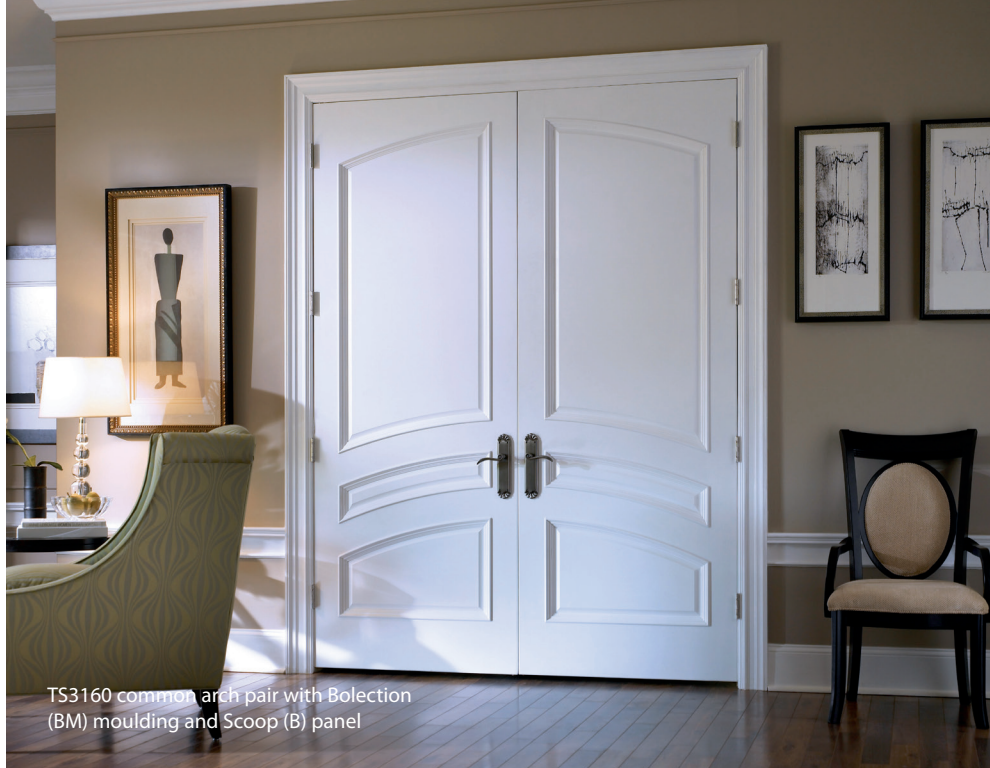
TS3160 common arch pair with Bolection (BM) moulding and Scoop (B) panel

Rather than placing two matching doors side by side, common arch pairs carry details across both doors creating a designed-in look.