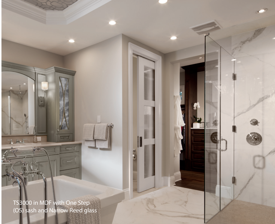
TS3000 in MDF with One Step (OS) sash and Narrow Reed glass