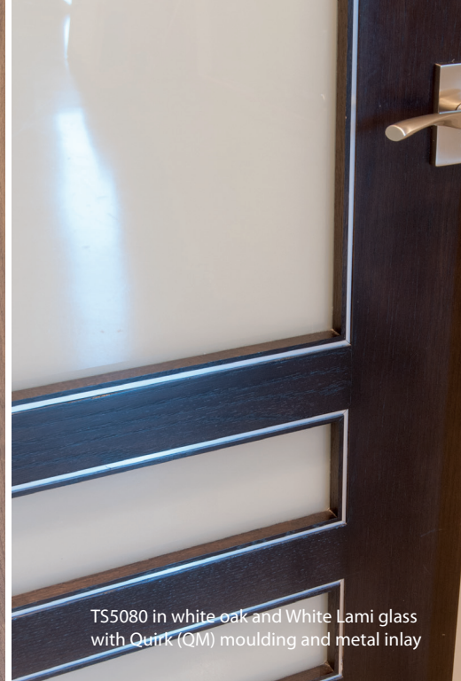
TS5080 in white oak and White Lami glass with Quirk (QM) moulding and metal inlay