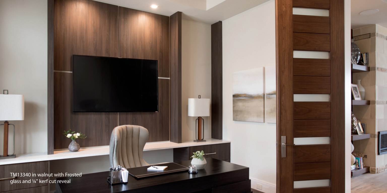
TM13340 in walnut with Frosted glass and ¼" kerf cut reveal