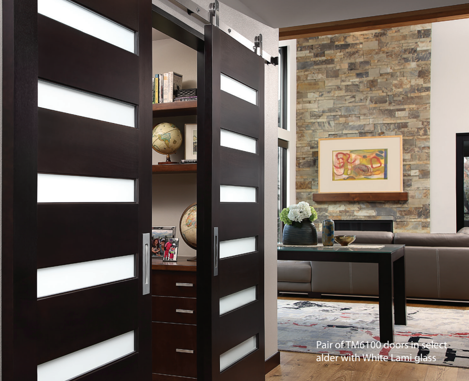
Pair of TM6100 doors in select alder with White Lami glass