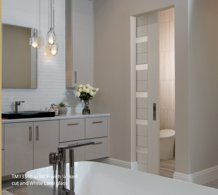
TM13340 in MDF with 1/4" kerf cut and White Lami glass