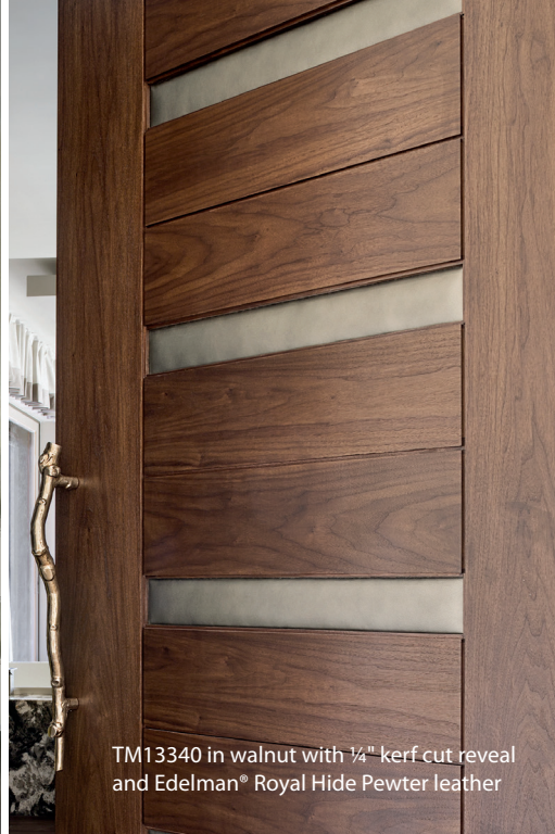
TM13340 in walnut with 1/4" kerf cut reveal and Edelman® Royal Hide Pewter leather