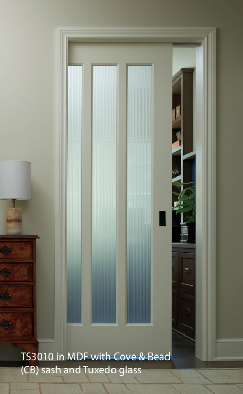
TS3010 in MDF with Cove & Bead (CB) sash and Tuxedo glass