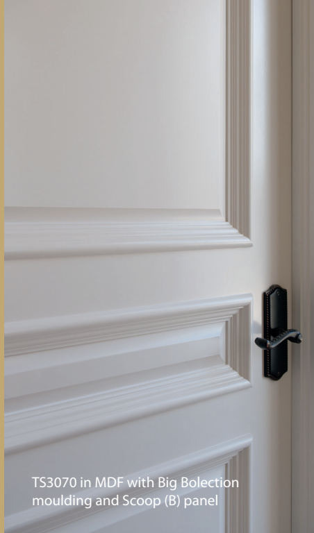
TS3070 in MDF with Big Bolection moulding and Scoop (B) panel