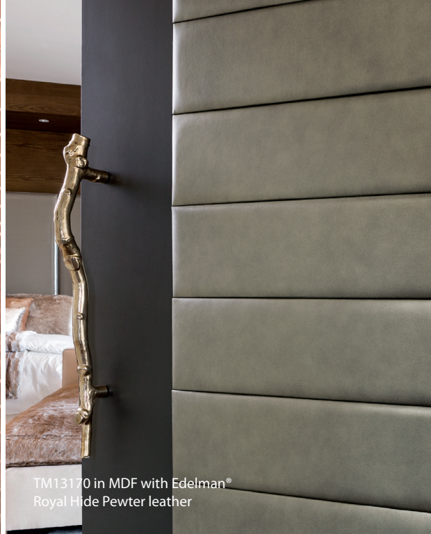
TM13170 in MDF with Edelman® Royal Hide Pewter leather