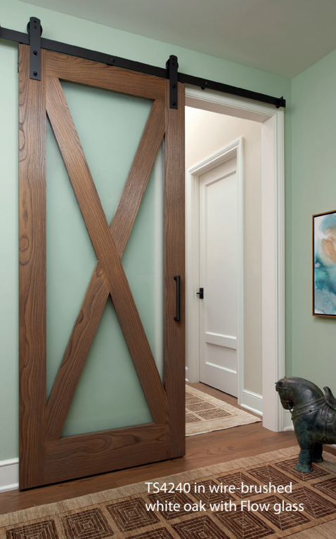
TS4240 in wire-brushed white oak with Flow glass