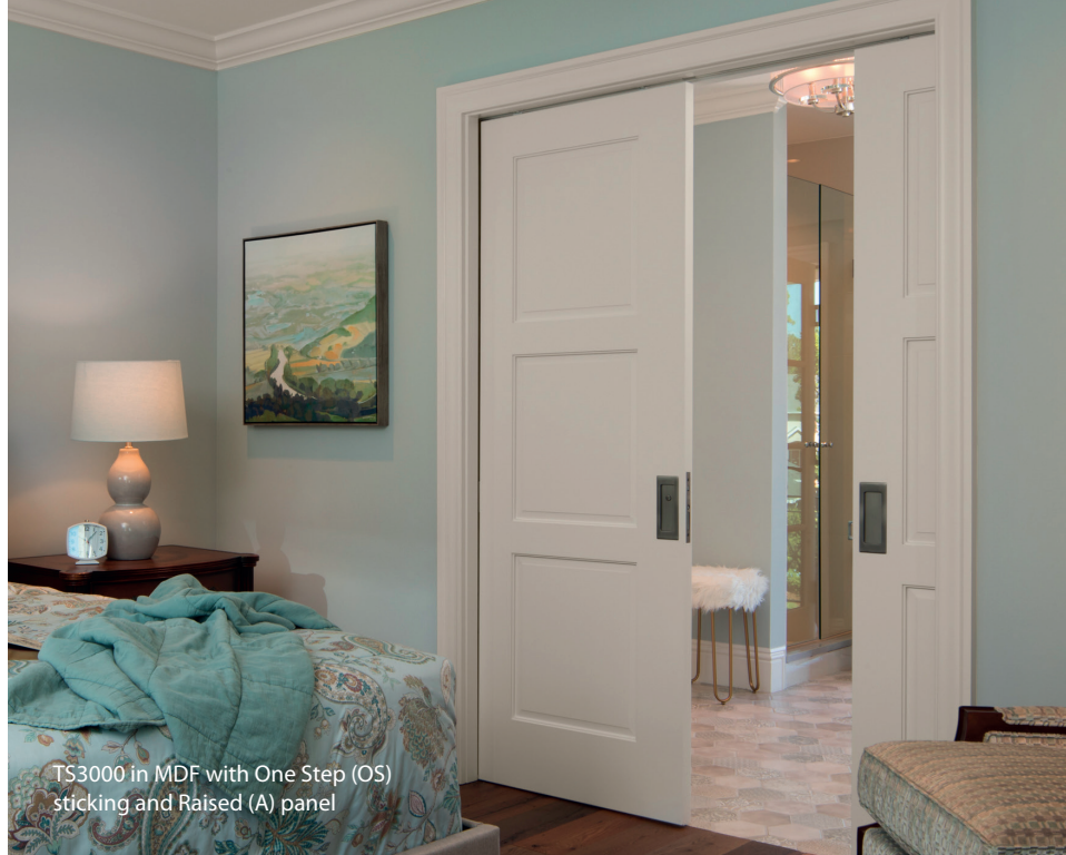
TS3000 in MDF with One Step (OS) sticking and Raised (A) panel

When every opening is designed to fit your exact specifications, we call it a TruStile Design Package. Take advantage of TruStile's flexibility and endless options to create your Design Package today.