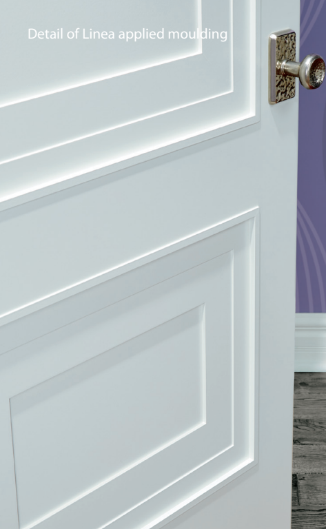
Detail of Linea applied moulding