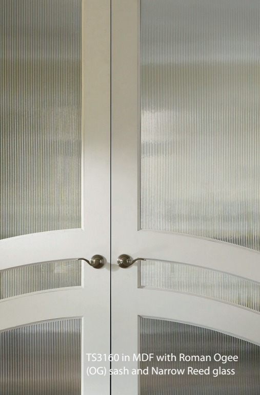
TS3160 in MDF with Roman Ogee (OG) sash and Narrow Reed glass