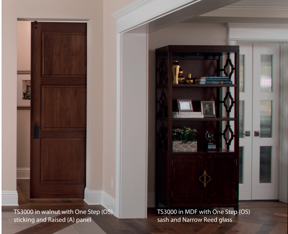
TS3000 in walnut with One Step (OS) sticking and Raised (A) panel