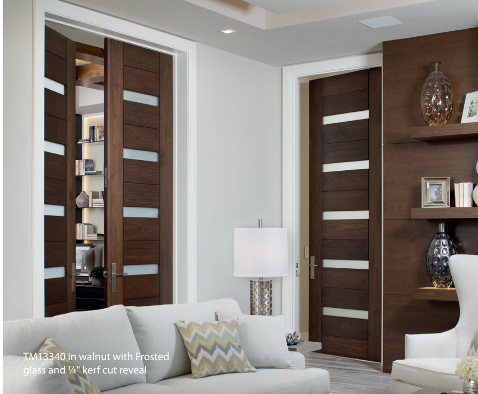
TM13340 in walnut with Frosted glass and 1/4" kerf cut reveal

At TruStile, we believe that every opening is an opportunity to enhance your home's design. Our commitment is to provide today's architects, designers, custom home builders and homeowners with interior doors that support the needs of today's custom projects. Over the next several pages we will walk you through the steps to elevate your next project using interior doors.