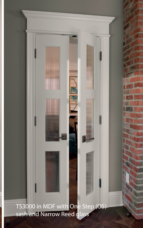
TS3000 in MDF with One Step (OS) sash and Narrow Reed glass