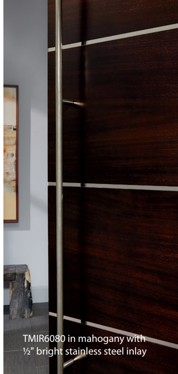
TMIR6080 in mahogany with 1/2" bright stainless steel inlay