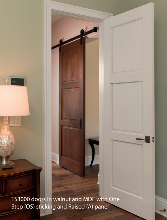
TS3000 doors in walnut and MDF with One Step (OS) sticking and Raised (A) panel