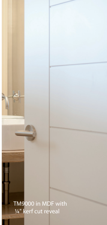
TM9000 in MDF with 1/4" kerf cut reveal