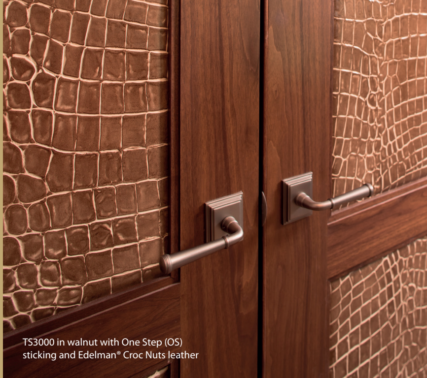
TS3000 in walnut with One Step (OS) sticking and Edelman® Croc Nuts leather