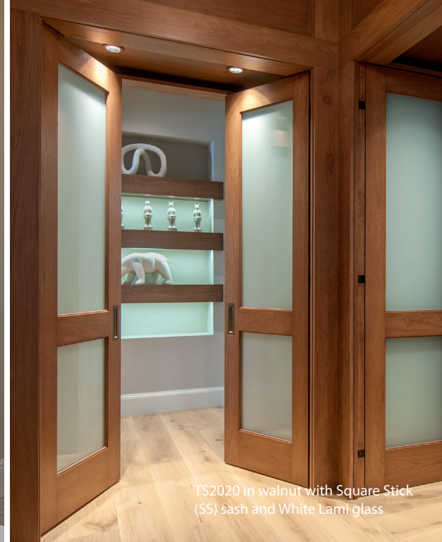
TS2020 in walnut with Square Stick (SS) sash and White Lami glass