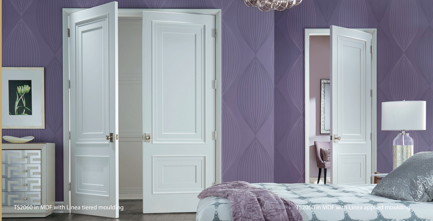
TS2060 in MDF with Linea tiered moulding