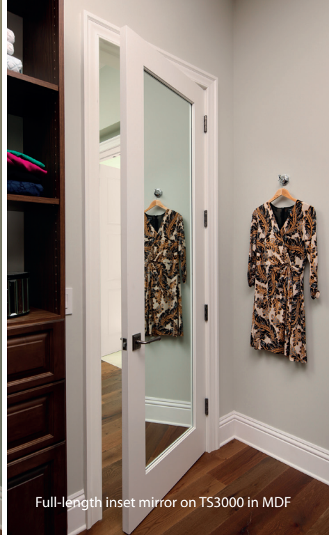
Full-length inset mirror on TS3000 in MDF