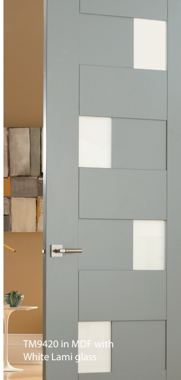
TM9420 in MDF with White Lami glass