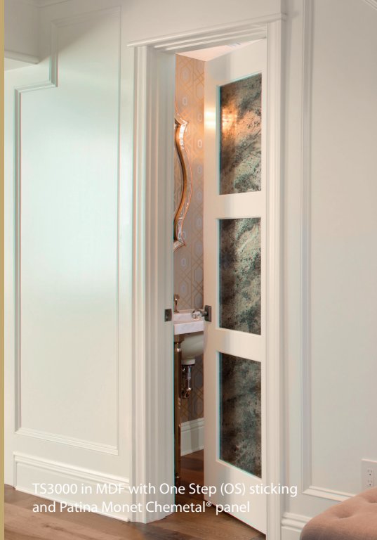
TS3000 in MDF with One Step (OS) sticking and Patina Monet Chemetal® panel