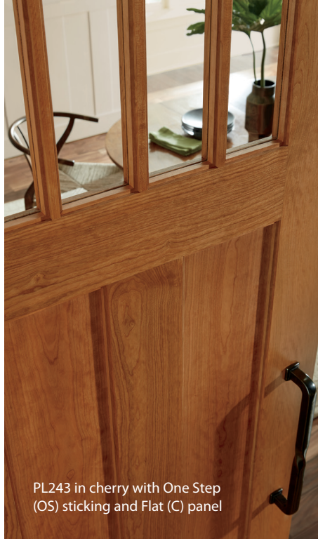
PL243 in cherry with One Step (OS) sticking and Flat (C) panel