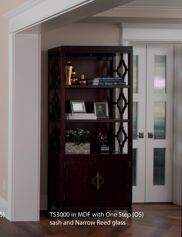
TS3000 in MDF with One Step (OS) sash and Narrow Reed glass