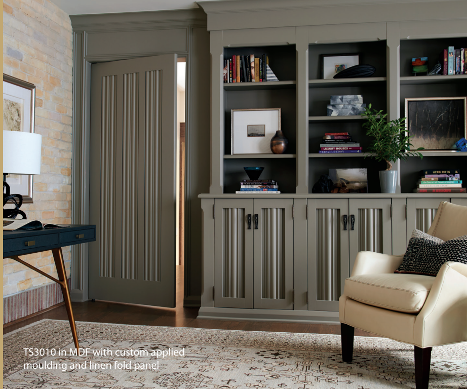
TS3010 in MDF with custom applied moulding and linen fold panel